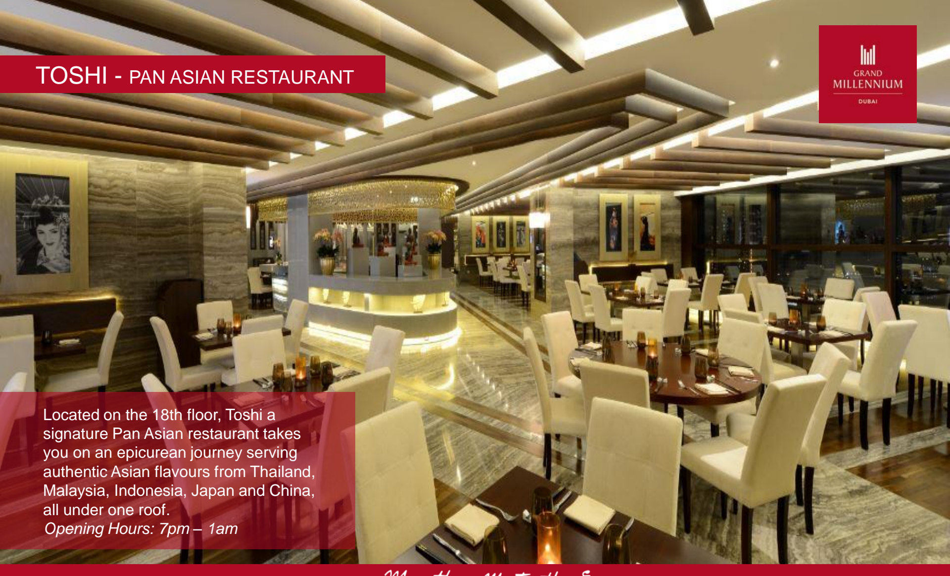
More than Meets the Eye