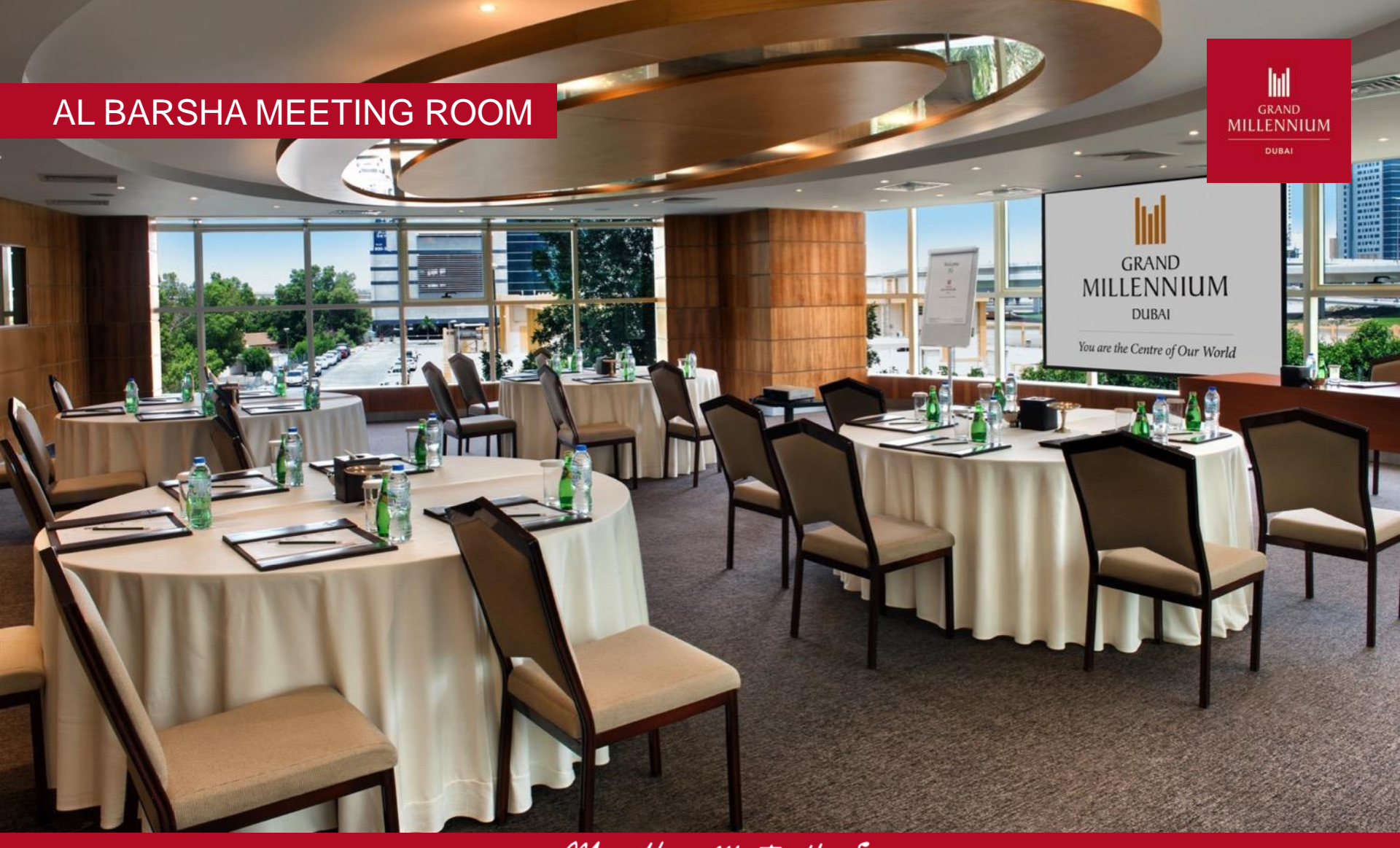
More than Meets the Eye