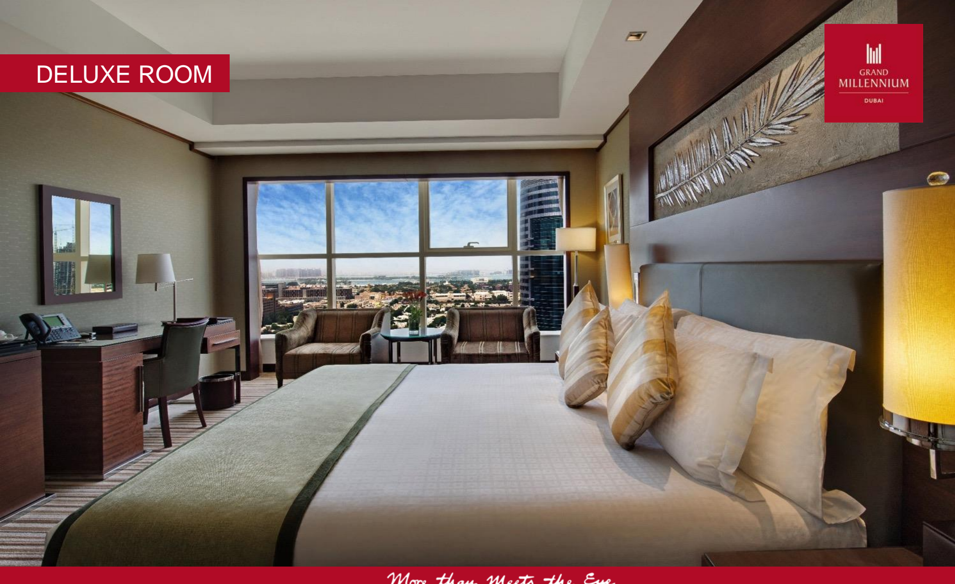
More than Meets the Eye