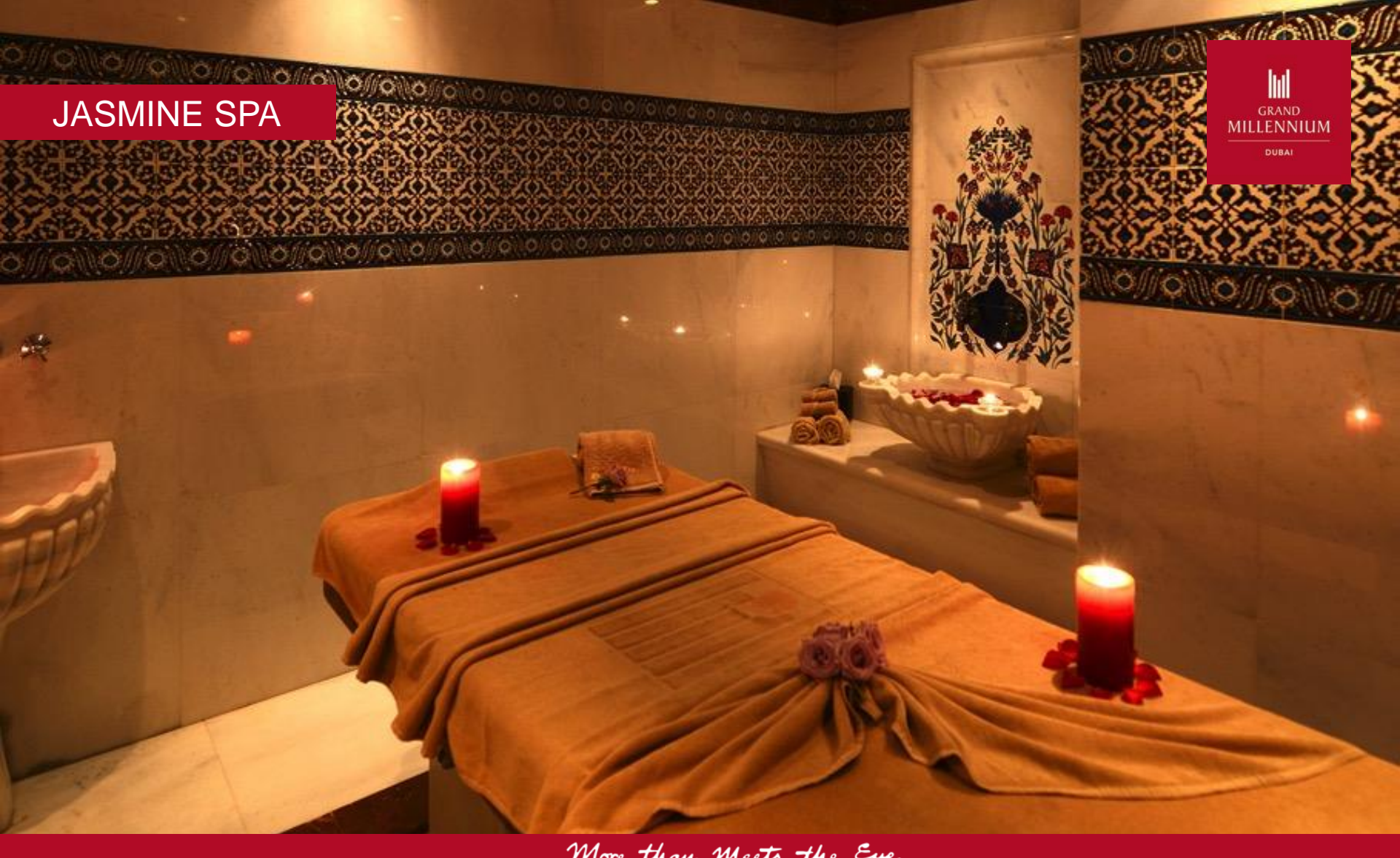
More than Meets the Eye