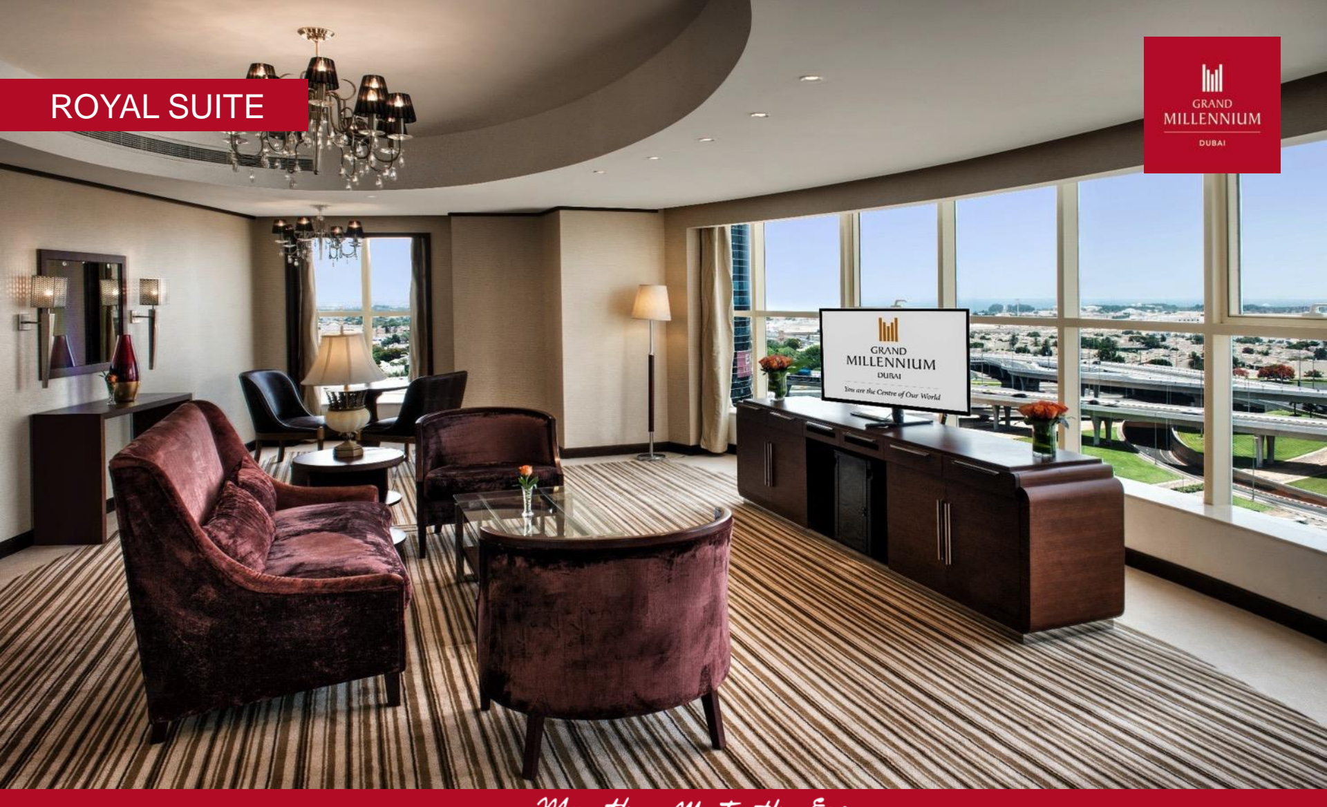
More than Meets the Eye