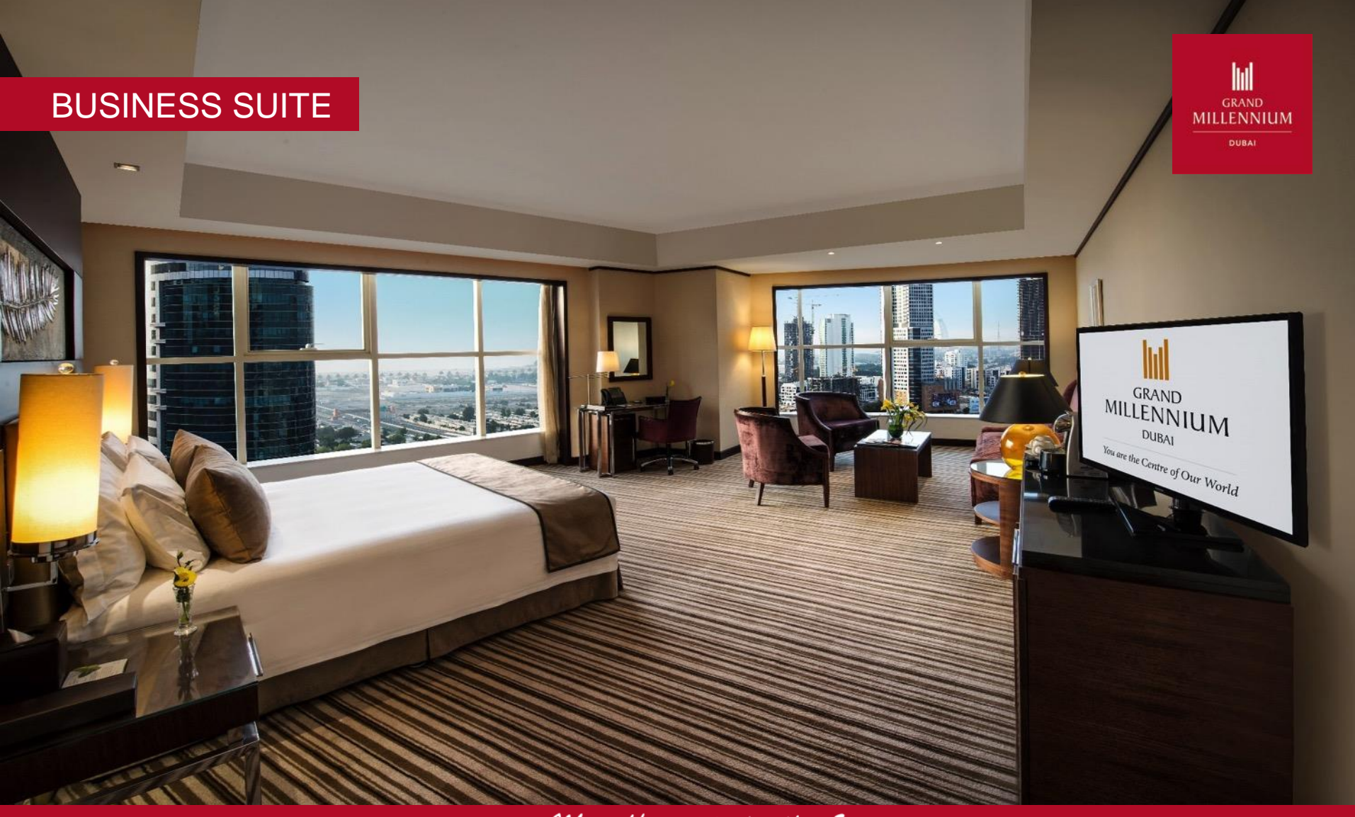
More than Meets the Eye