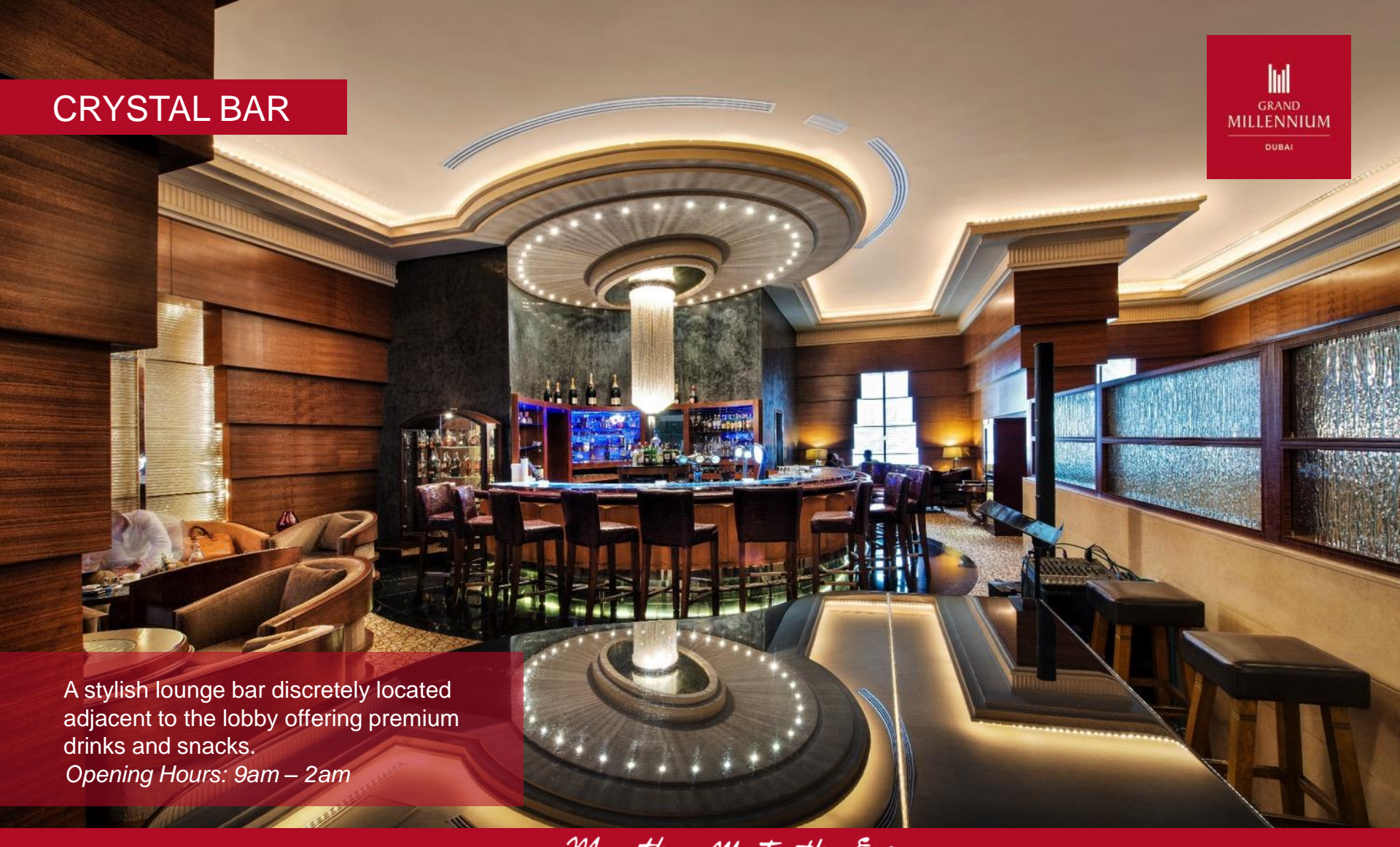
More than Meets the Eye