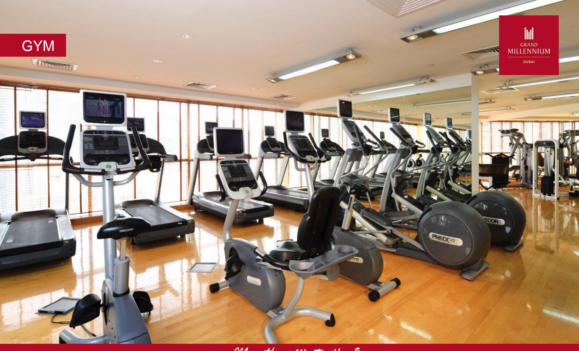
More than Meets the Eye