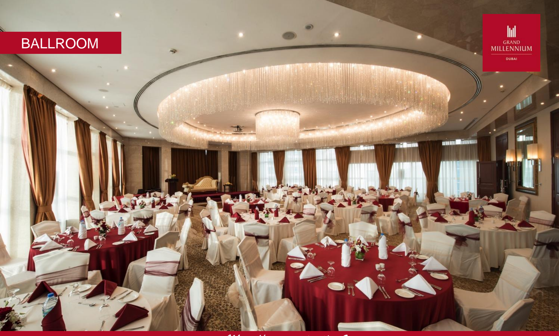
More than Meets the Eye