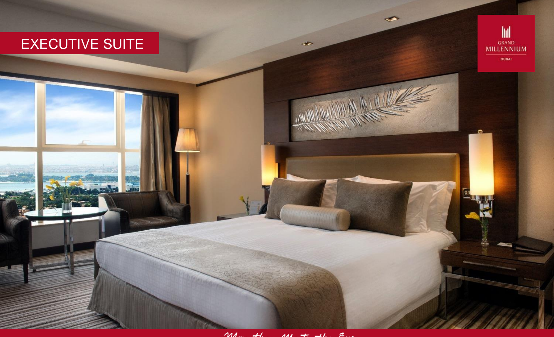
More than Meets the Eye