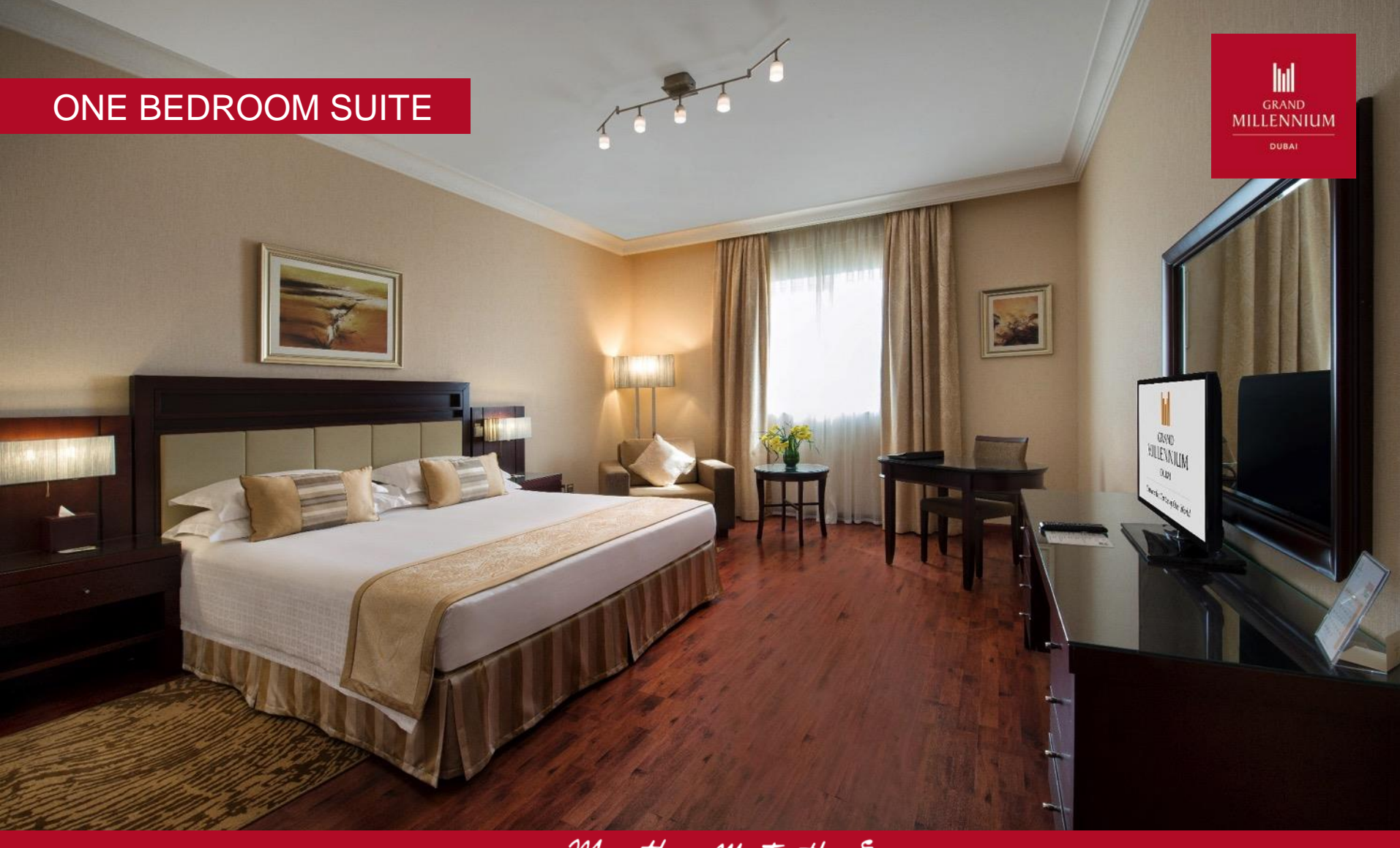
More than Meets the Eye