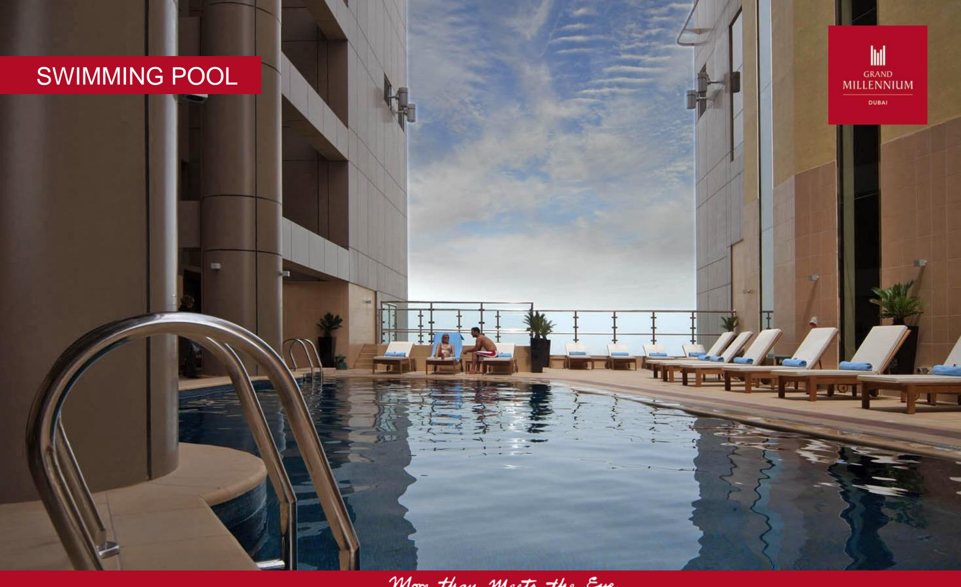
More than Meets the Eye