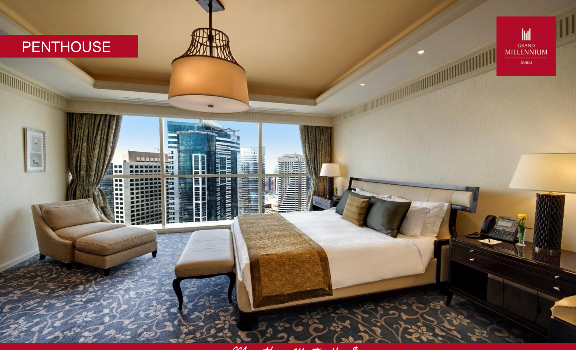
More than Meets the Eye