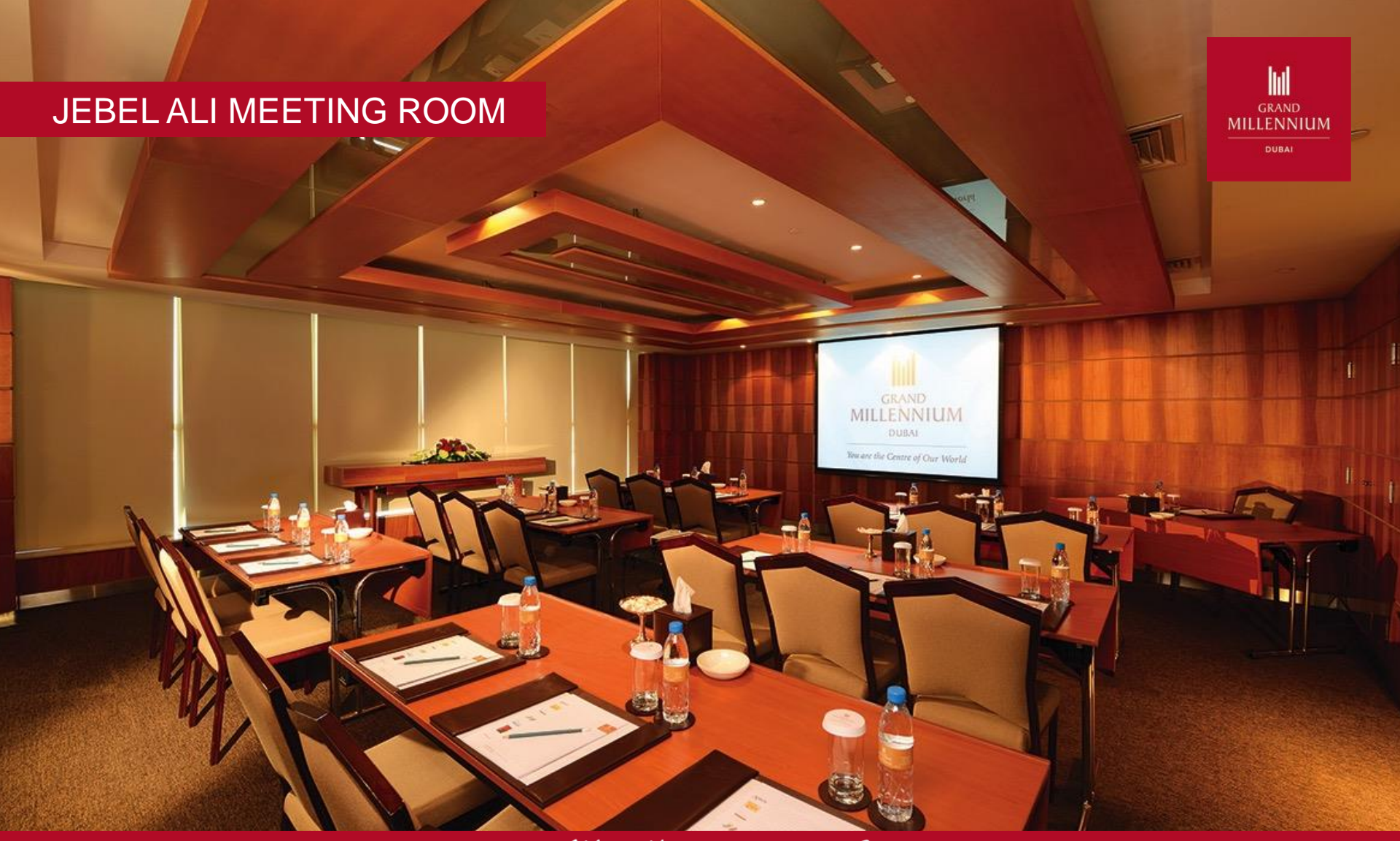
More than Meets the Eye