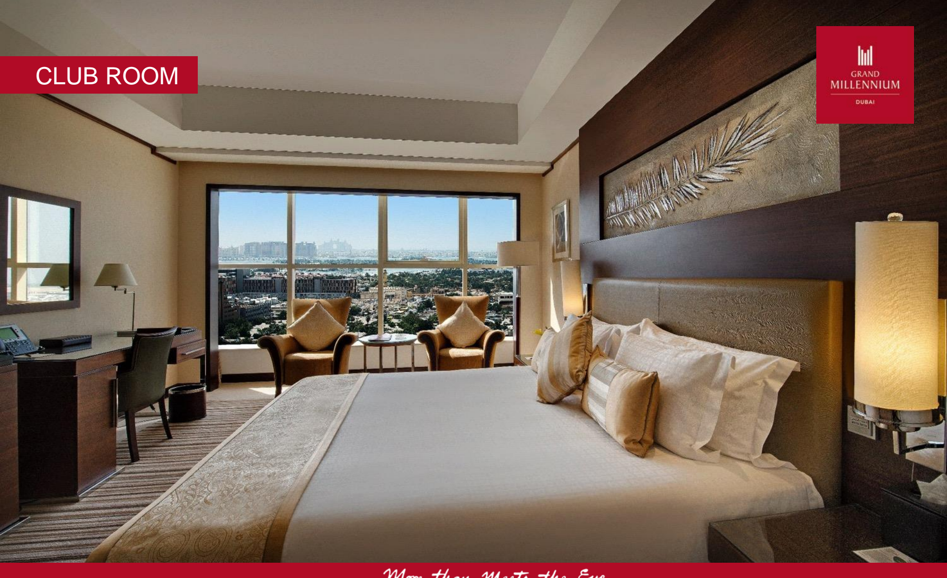
More than Meets the Eye