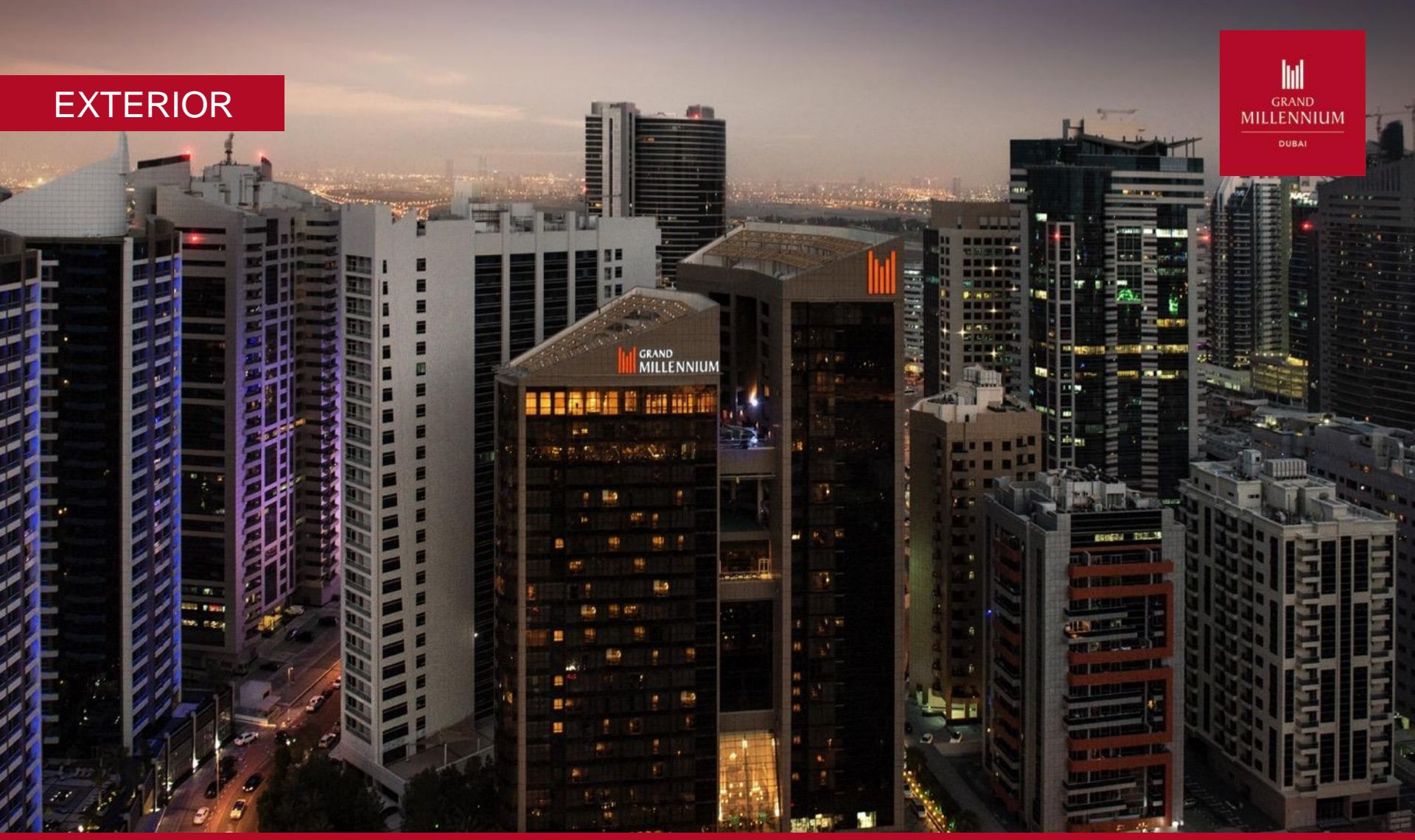
More than Meets the Eye